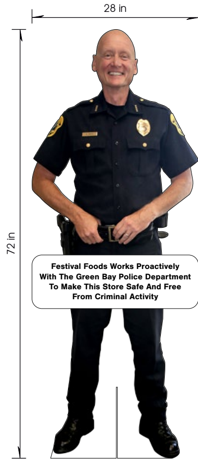
Proposed Cut Outs: 3/4" = 1' (2) Required